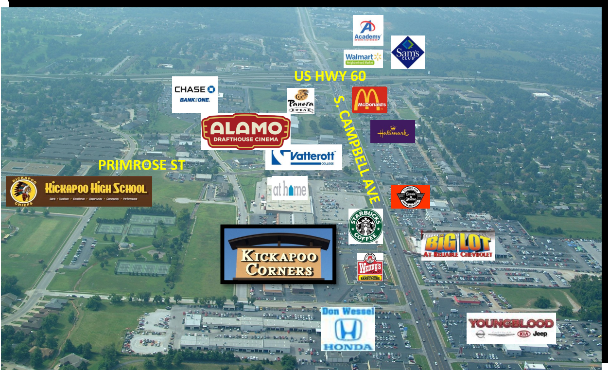
Kickapoo Corners View to the South